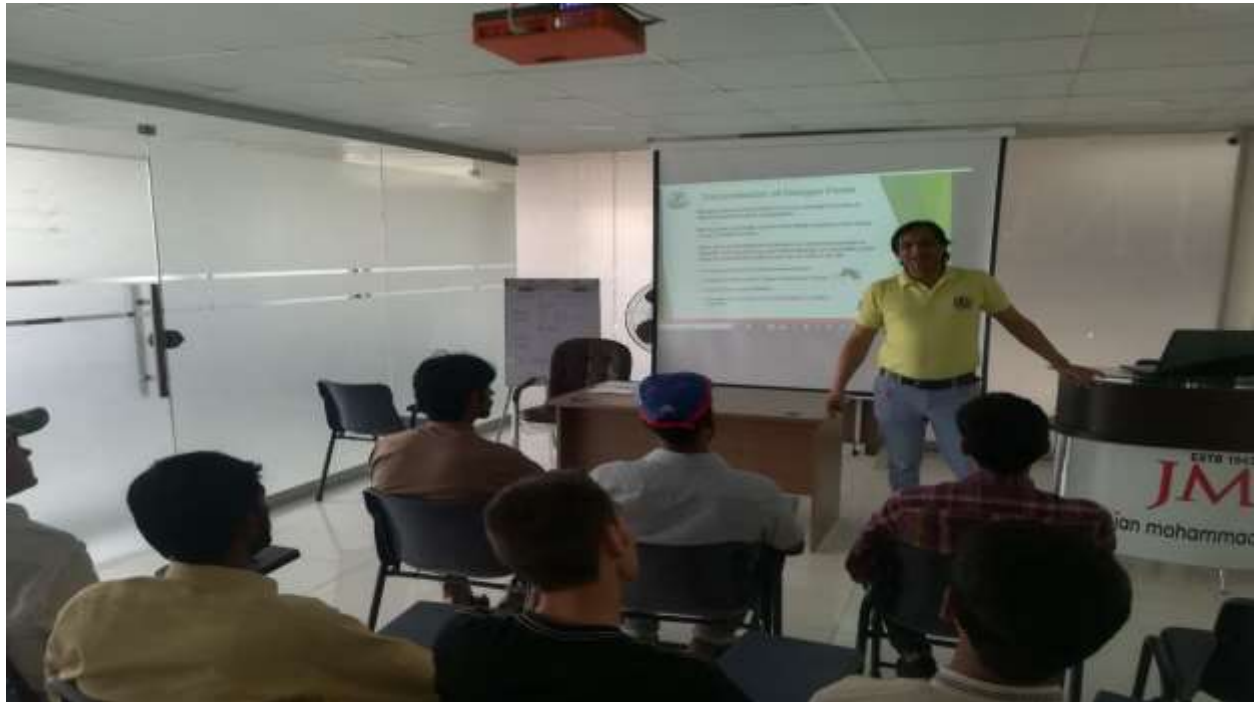
Caption: ESDF dengue awareness and environmental conservation session which was held in Rawalpindi on 24, April, 2018.

well. The organization also emphasizes on the environmental cleanliness which can reduce the threat of dengue fever as well.